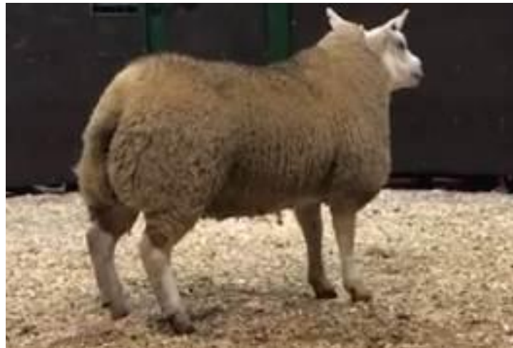
New Centre Record - £380 – Full Report Inside

110 Cast Cows sold to 194ppk or £1605 5 Stock Bulls sold to 175ppk or £1758 4 Cows & Calves sold to £1300 107 Store Steers sold to £1300 95 Store Heifers sold to £1070 58 Young Bulls sold to £1110 123 Breeding Sheep sold to £380 864 Store Hoggs sold to £108